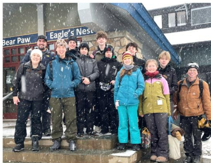
Youth Ski Trip to Spirit Mountain